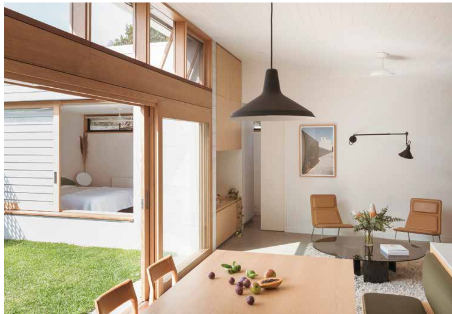
The courtyard garden brings northern light deep into communal areas.