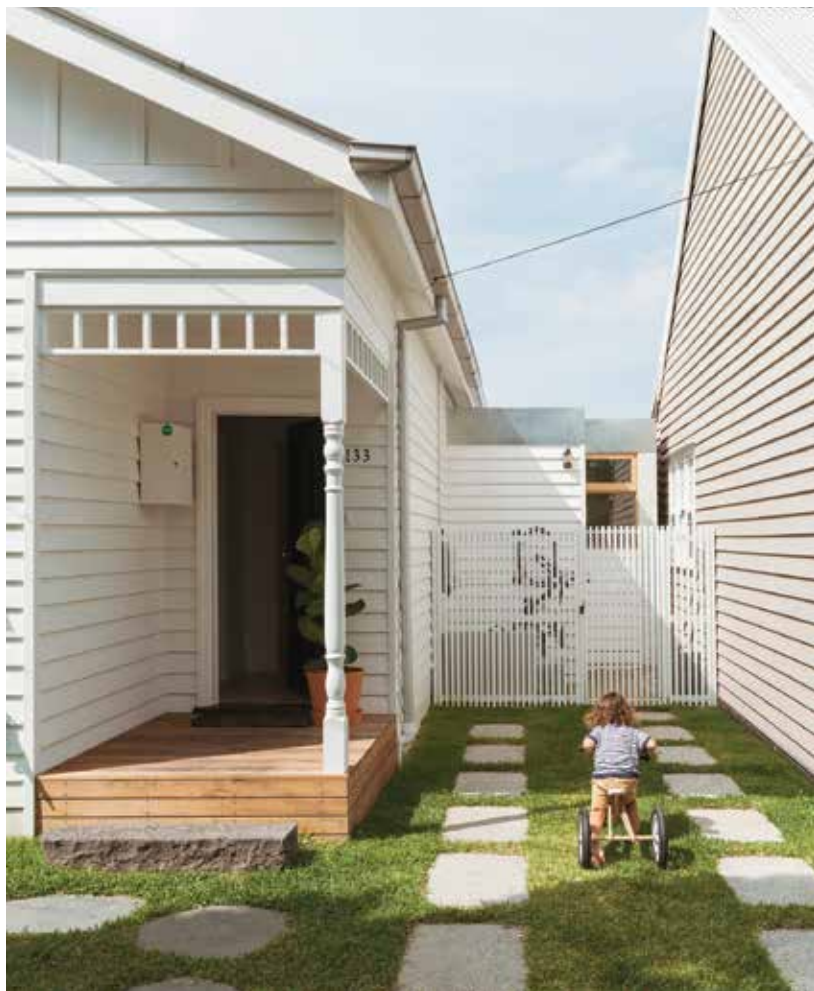
top left An initial plan placing a master suite at the front was knocked back to preserve the heritage-listed façade. right The play of light throughout the day, particularly in communal areas, is a project highlight for the architect. bottom left The owners concede they took some convincing about the kitchen/dining area's splash of green, which they now love. right Extensive joinery and minimal furniture streamline the compact space.