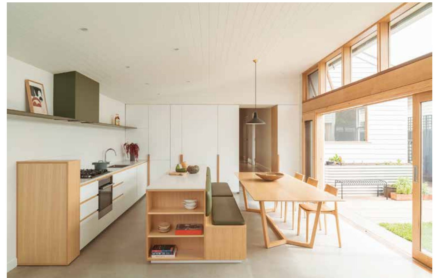
Carefully crafted joinery like this integrated island and dining bench are integral to functionality. opposite page The addition performs well enough spatially and energetically for the clients to keep it open for much of summer.

Emlyn's design reconceives Pat and Maddy's home as a modernist-inspired courtyard house with minimalist joinery for uncluttered warmth and functionality. At the front, two original bedrooms were retained and updated (with ceiling fans added for air flow). Emlyn reinstated and added joinery to a central hallway, created a light-filled bathroom off to one side, updated a laundry on-the-cheap with store-bought cabinetry topped with a Victorian ash bench, and transformed a 90s kitchen-dining area into a study/guest room with generous glazing and lovely views to the courtyard garden opposite.